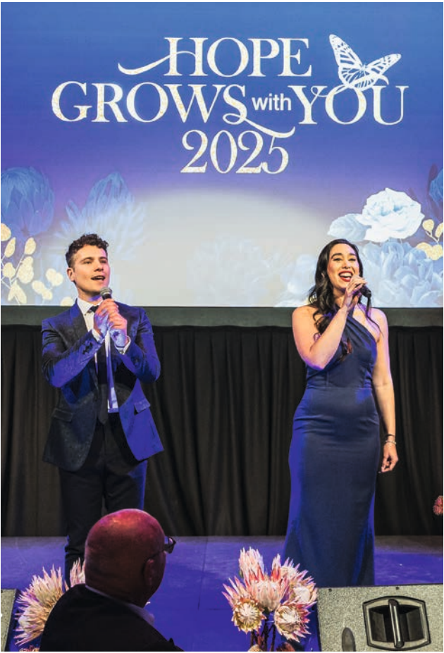
Pictured: Performance by The Australian Musical Company.

In August, we celebrated some of our inspiring community of donors and supporters at our 2025 Donor Appreciation Event, ‘Hope Grows with You’. Monash Health is supported by an incredible community, whose generosity is vital in enabling us to continue advancing world-class care and making a meaningful impact on the lives of countless patients and families. Over 250 donors, volunteers, and supporters of Monash Health joined us at the Arts Centre Melbourne to celebrate gratitude, hope and the positive difference they make to the care we provide our community every day. Thank you to those who joined us and shared their personal stories of the power of hope, and to our entire donor community for their unwavering support and generosity.